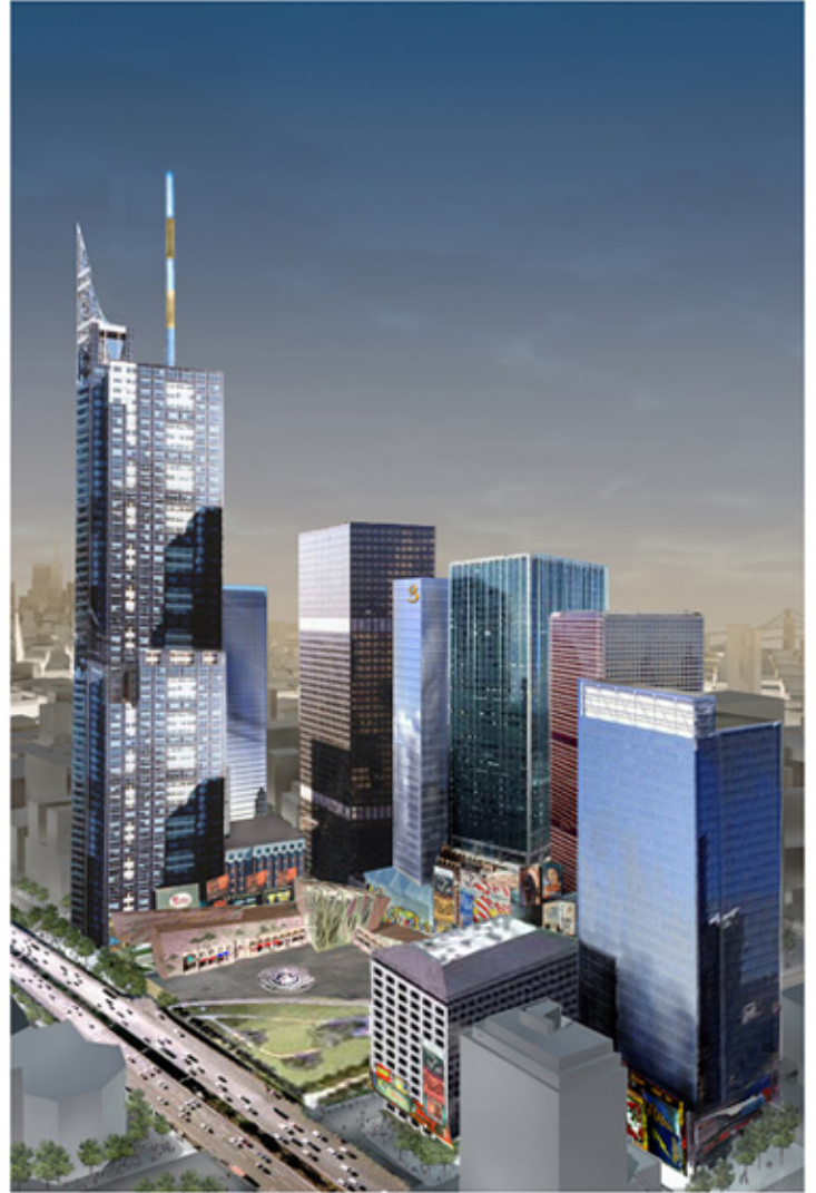
Impact of recent attacks on master plan

The following changes have been proposed to the Libeskind master plan, which could result in the mundane-looking “business-as-usual” office development shown at the right: